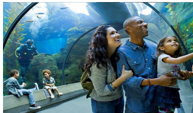
The California Science Center Foundation received a 501(c)(3) Bond

Small Business Finance Center – includes: