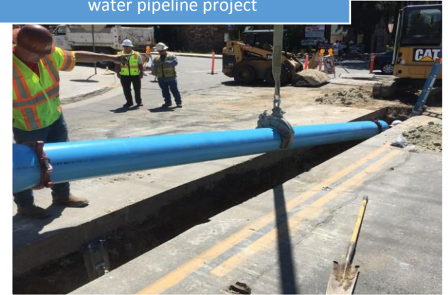
City of Big Bear Lake received funding for a water pipeline project